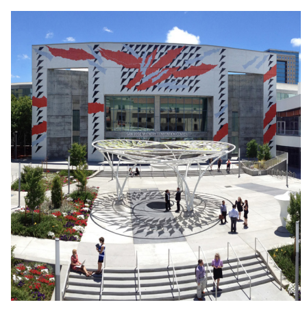
San Jose McEnery Convention Center 150 W San Carlos Street San Jose, CA 95113

Please use the addresses shown below to publicize your events. Do not use these addresses to ship items directly to our venues without the prior approval of your Event Services Manager.