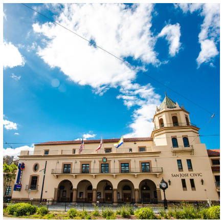
San Jose Civic 135 W San Carlos Street San Jose, CA 95113 Directly across San Carlos of San Jose McEnery Convention Center main entrance