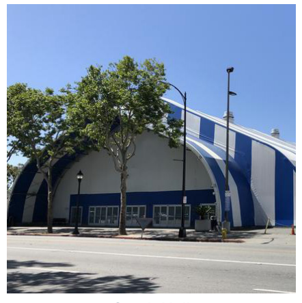
South Hall 435 Market Street San Jose, CA 95113