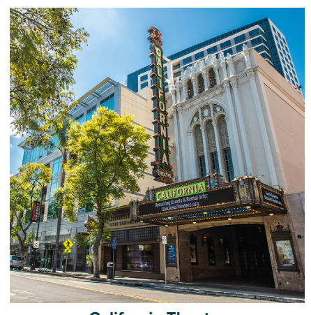
California Theatre 345 South First Street San Jose, CA 95113 Across Market, east of the San Jose McEnery Convention Center