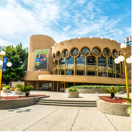
Center for the Performing Arts (CPA) 255 Almaden Boulevard San Jose, CA 95113 Adjacent from the San Jose McEnery Convention Center, at the corner of San Carlos & Almaden